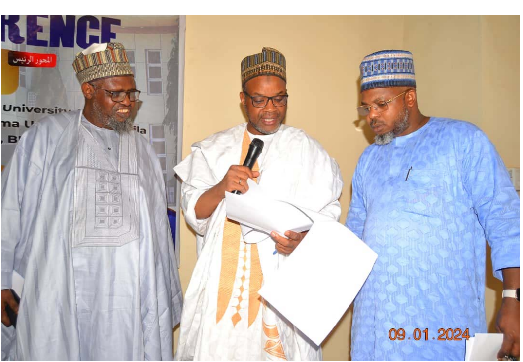
CICID FORMER AND CURRENT DIRECTORS