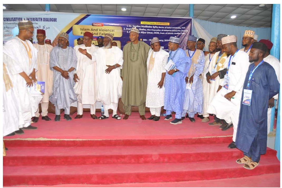
A GROUP PICTURE AT THE OPEING CEREMONY