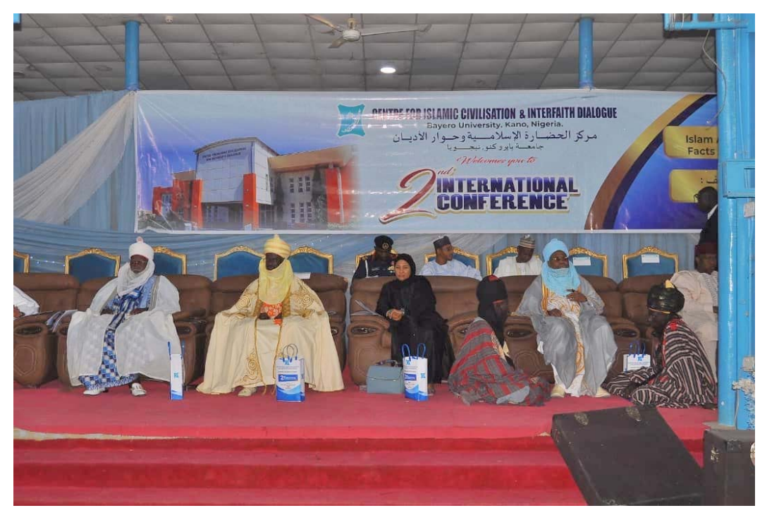
SOME TRADITIONAL RULERS WHO ATTENDED THE CEREMONY